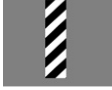
Figure 2: The barberpole illusion. A pattern of linear symmetry is wrapped around a cylinder, and rotated. The true motion is rotation left or right but the perceived motion by the observer is up or down

Whether a region is "nice" or "bad" depends on how big we make it. Making a region bigger, makes it more likely to gather observations from the image that provide new directional information. Making a region bigger will have the drawback of reducing the resolution of the resulting optical flow, so a compromise is necessary: