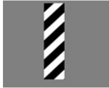
Figure 2: The barberpole illusion. A pattern of linear symmetry is wrapped around a cylinder, and rotated. The true motion is rotation left or right but the perceived motion by the observer is up or down

Whether a region is "nice" or "bad" depends on how big we make it. Making a region bigger, makes it more likely to gather observations from the image that provide new directional information. Making a region bigger will have the drawback of reducing the resolution of the resulting optical flow, so a compromise is necessary: